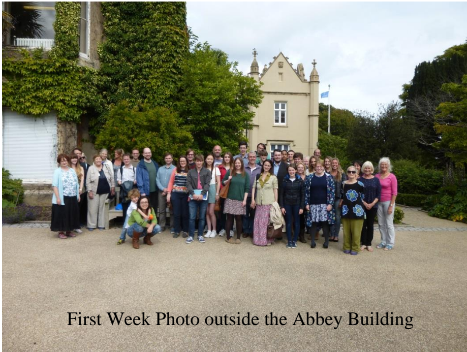
First Week Photo outside the Abbey Building

Overall the Summer School ran well and because of its success this year we are currently preparing for next year where we plan to run it again with additional classes, different extracurricular activities and more staff. To view our website for this year please visit: http://www.swansea.ac.uk/artsandhumanities/hc/summerschoolinancientlanguages/ .