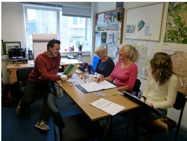
Advanced Greek Classes