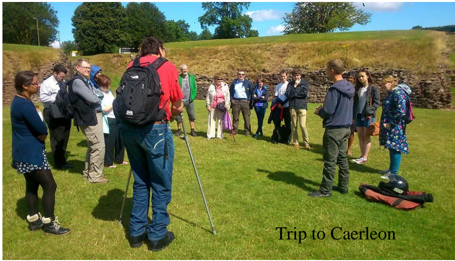
Trip to Caerleon